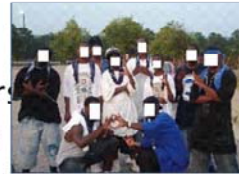
MCAS Beaufort Marines flashing Crip signs as posted on MySpace.com.