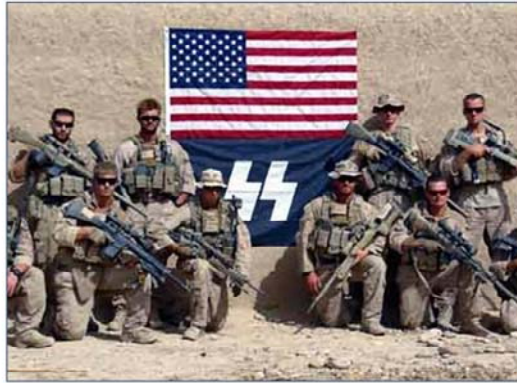
C CO, 1 ST RECONNAISSANCE BN SEPTEMBER 2010 HELMAND PROVINCE, AFGHANISTAN

This photo made the Army Times on February 27, 2012. Although these Marine snipers posing in front of the Nazi-associated SS insignia, deny that this flag indicates a link to Nazis and white supremacists, the message that it sends to many who see it is not positive.