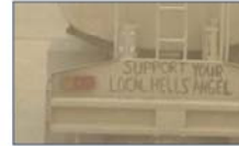
Army tanker with "support your local Hells Angel" inscribed on back.

Gang members have been reported in every branch of the military, although a large proportion of these gang members are affiliated with the U.S. Army Reserves and National Guard branches